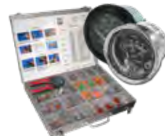
Instrumentation Gauges and Fittings