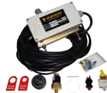
Fatigue Warning Systems