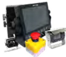
Electrical and Electronic Solutions. Rear Vision Cameras