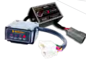
Engine Warning Systems