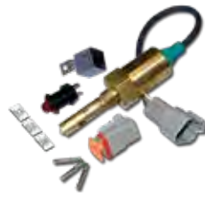
Coolant, Oil and Low Fuel Kits