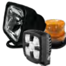
Hid Flood and Strobe Lights