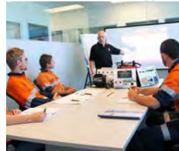
Product Skills Training