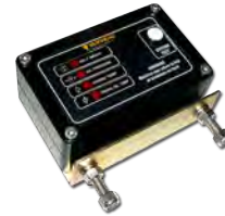
Engine Protection Systems