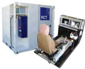
Telerelease Control Systems