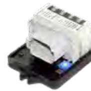
Seat Belt Warning System