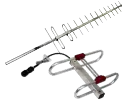
Telerelease Communication Systems