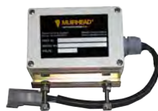
Vehicle Warning Rollover System