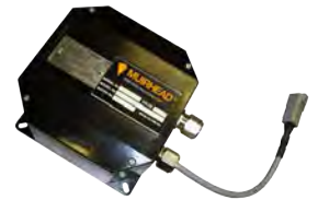
Fuel Cap Isolation