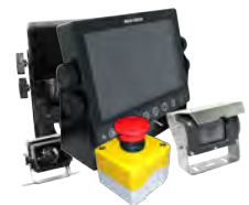
Electrical and Electronic Solutions