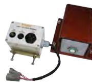
Tray Collision Warning System