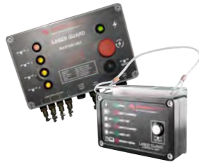
Laser Guard Barrier Systems