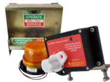
Live Fuel Lockouts