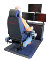
Fibre Optic Surface Solution