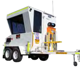
Dozer Trailer Cabin