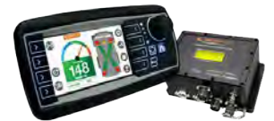
Payload Management Systems