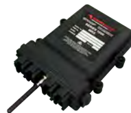
Collision Awareness/Avoidance Systems