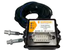
Park Brake Warning