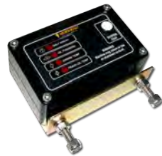
Engine Protection Systems