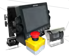
Electrical and Electronic Solutions / Rear Vision Cameras