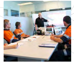
Product Skills Training