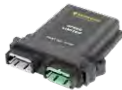
Electronic Speed Limiters