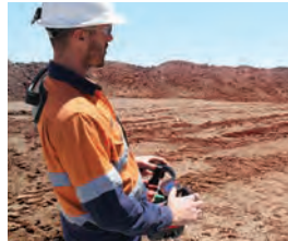
Remote Control Systems (LOS)