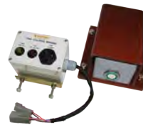
Tray Collision Warning System