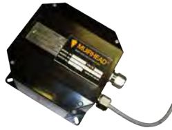
Fuel Cap Isolation